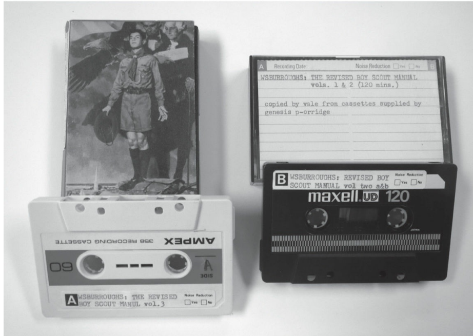
W. S. BURROUGHS: THE REVISED BOY SCOUT MANUAL. READ BY WSB. COPIED BY VALE FROM CASSETTES SUPPLIED BY GENESIS P-ORRIDGE.